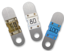
One Hole BF1 Fuses