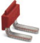
Insertion bridge, Number of positions: 2, Color: red

Insertion bridge - EB 2- DIK RD - 2716693