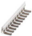
Insertion bridge, Number of positions: 80, Color: white

Insertion bridge - EB 80- DIK WH - 2715788