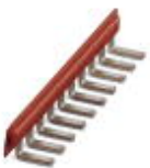
Insertion bridge, Number of positions: 80, Color: red

Insertion bridge - EB 80- DIK RD - 2715953